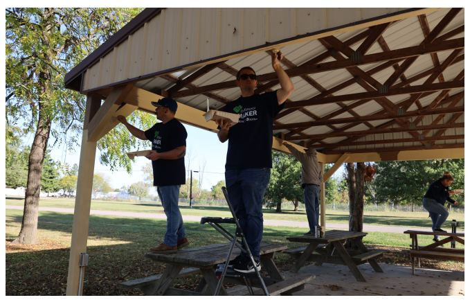
Painting shelter houses at Johnson County Park.