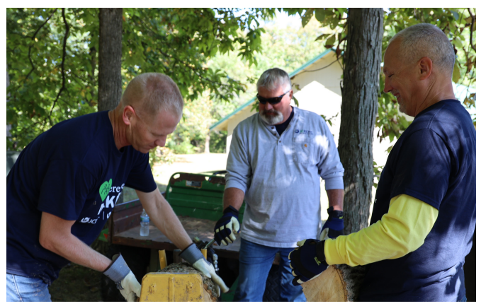
Fall clean-up at the Indiana FFA Leadership Center.

JCREMC employees completed two service projects as part of Indiana Electric Cooperative's Community Day last October. The statewide event included 26 cooperatives completing nearly 40 unique service projects, demonstrating one of our core Cooperative Principles: Concern for Community. Our team members served at the Indiana FFA Leadership Center, assisting with fall clean-up around the property. We also gave fresh coats of paint to shelter houses at Johnson County Park.